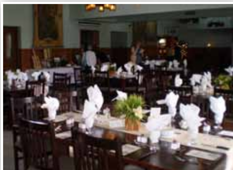
Restaurant Sainte-Marie Dinner